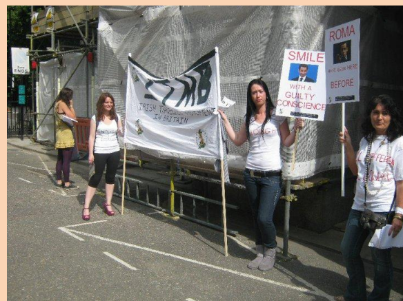
Demonstrators at the solidarity protest

You can also still the ITMB petition at www.petitiononline.com/ITMB .