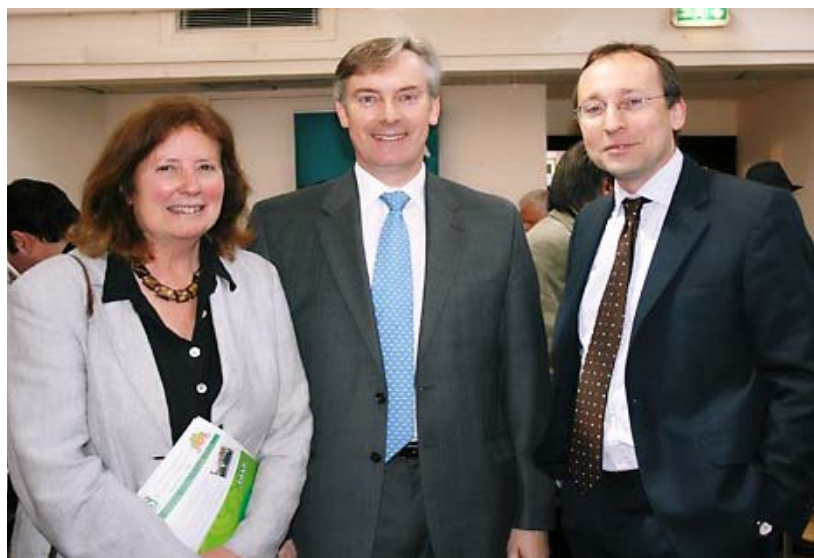
Julie Morgan MP and Andy Slaughter MP with the Irish Ambassador