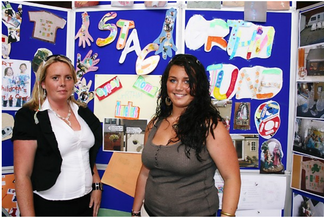
Southwark Travellers' Action Group Stall