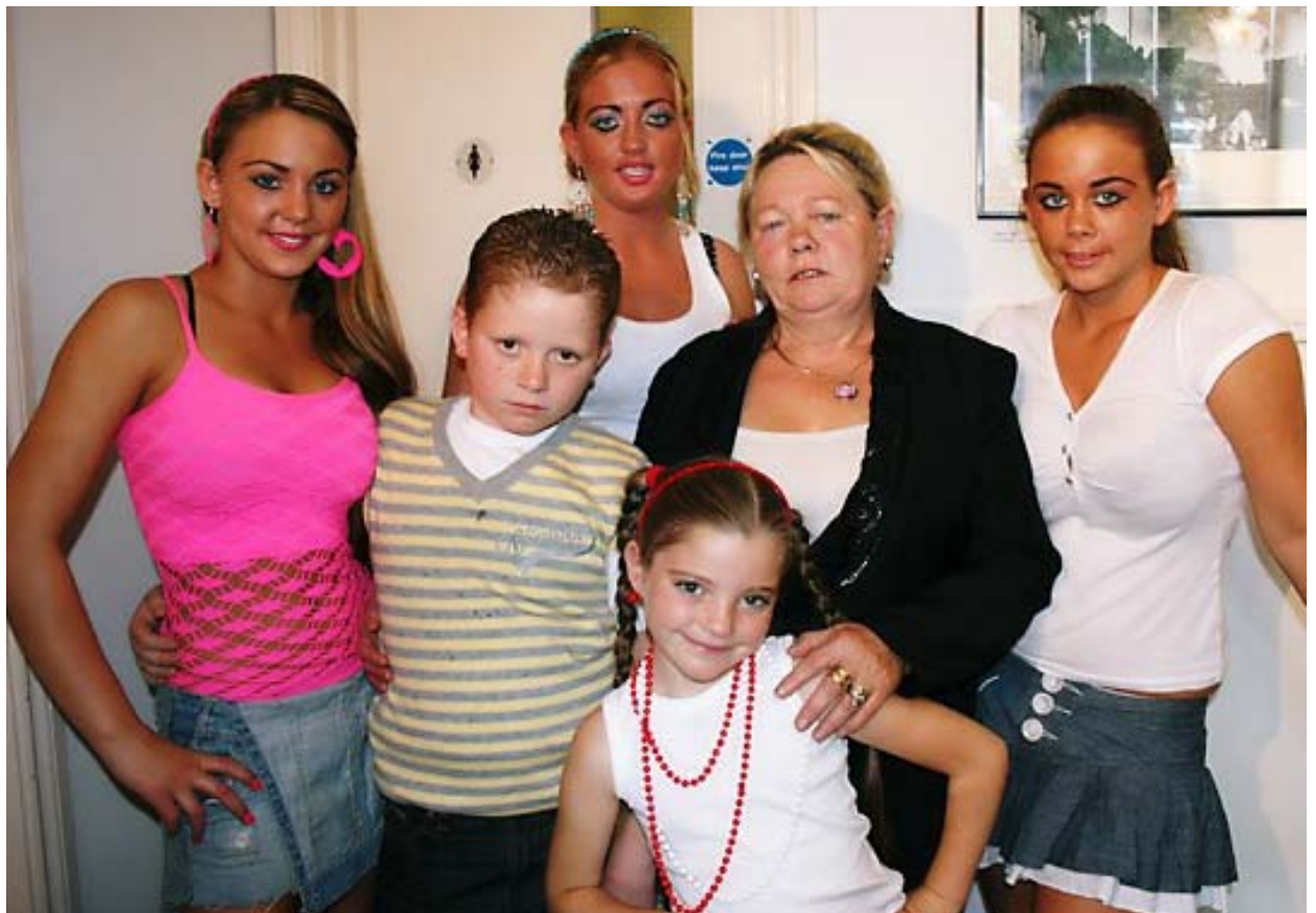
Some guests from Liverpool